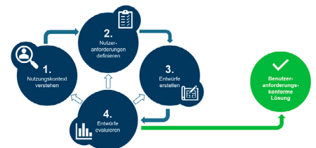
User-Centered Design (UCD) cycle according to DIN ISO 9241-210